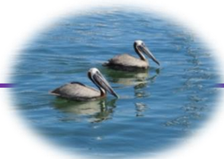
Microplastics in waterways