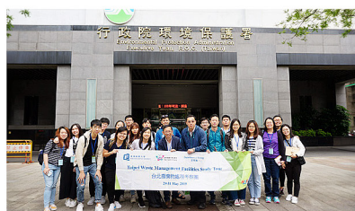
Taipei Waste Management Facilities Study Tour