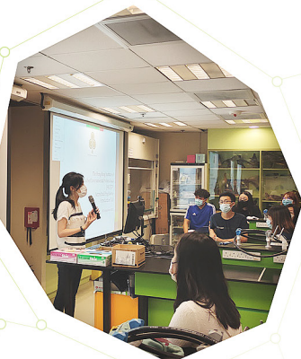
HKIQEP Accredited Programme