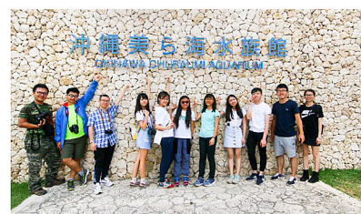
Okinawa, Japan Excursion