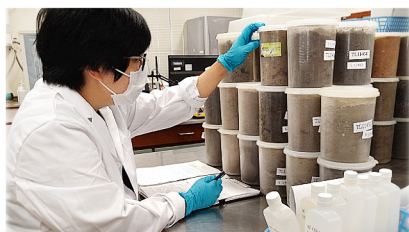
Internship in Agriculture, Fisheries and Conservation Department, Government of HKSAR