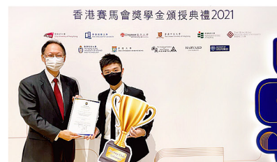
The Hong Kong Jockey Club Scholarship