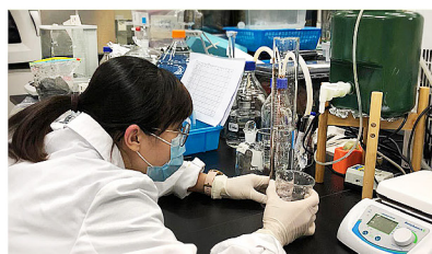
Undergraduate Summer Research Programme